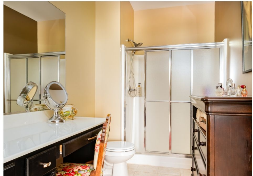
816 Charlevoix Way · Schererville