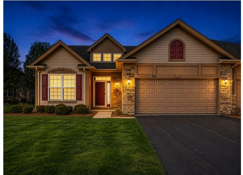
816 Charlevoix Way · Schererville