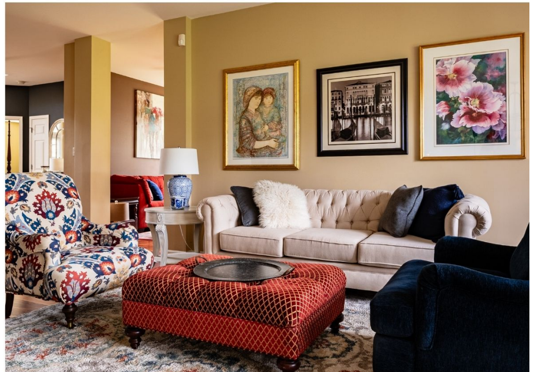
816 Charlevoix Way · Schererville