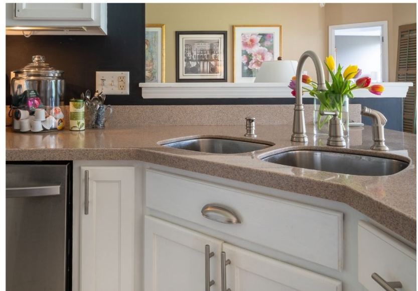
816 Charlevoix Way · Schererville