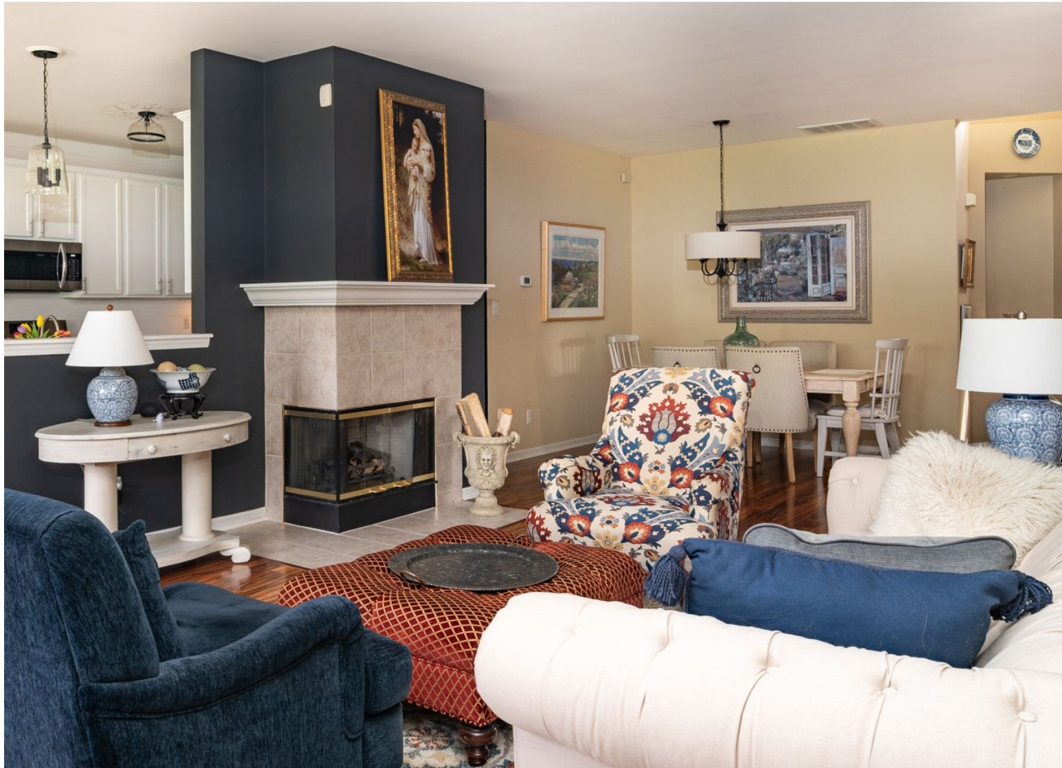
816 Charlevoix Way · Schererville