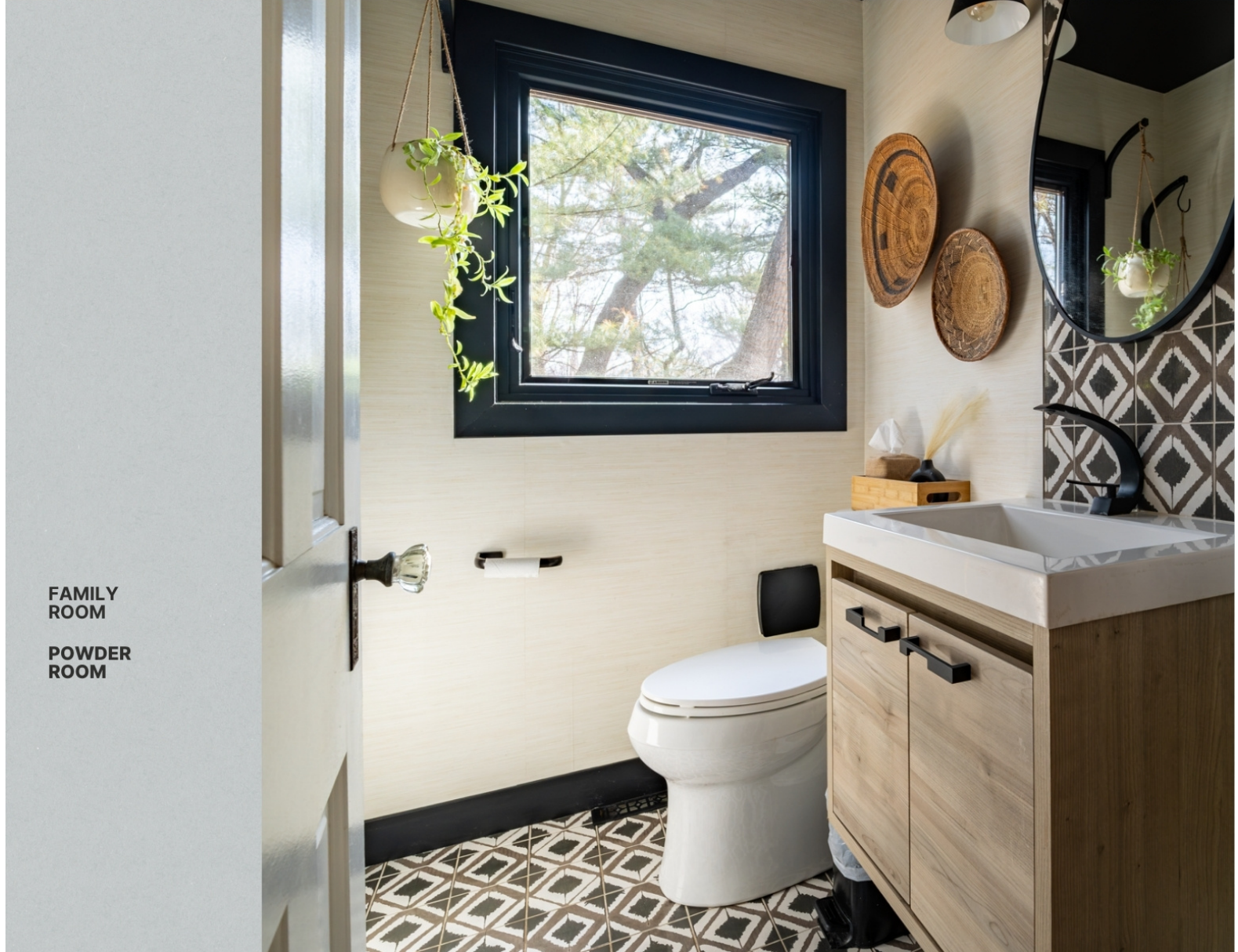
FAMILY ROOM POWDER ROOM